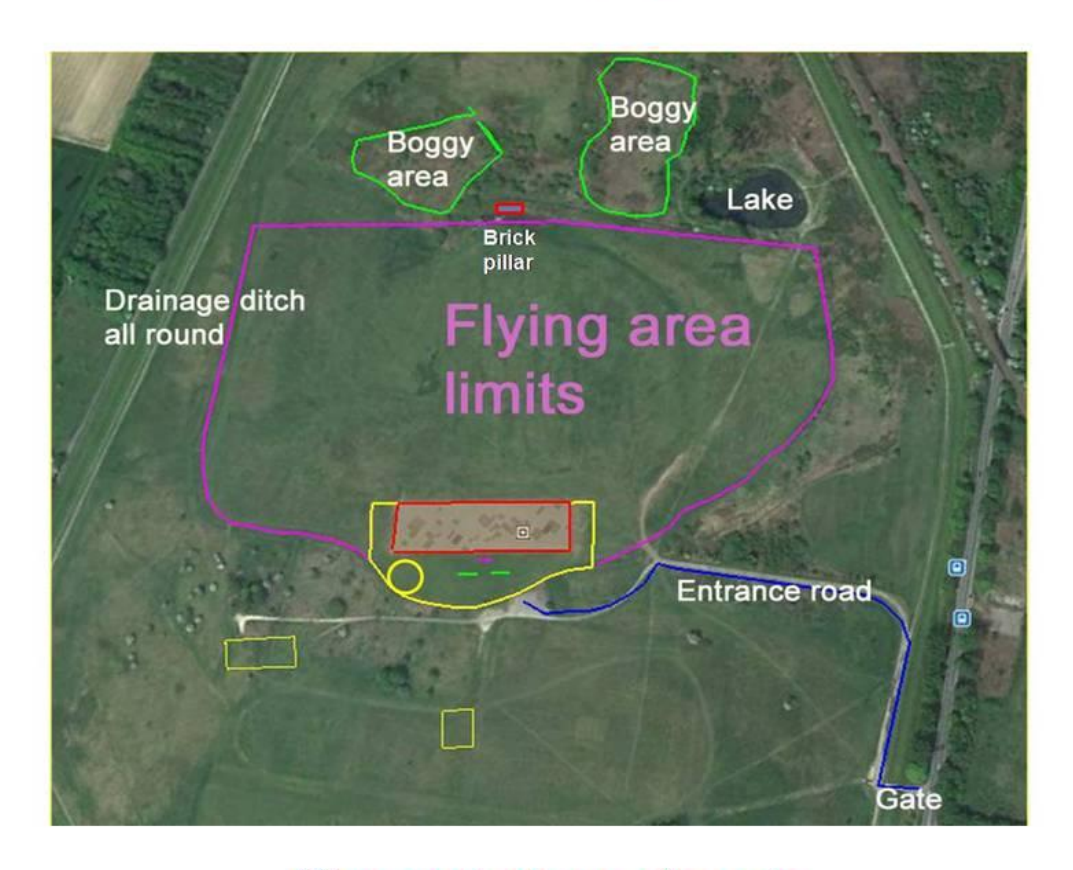
General view of park